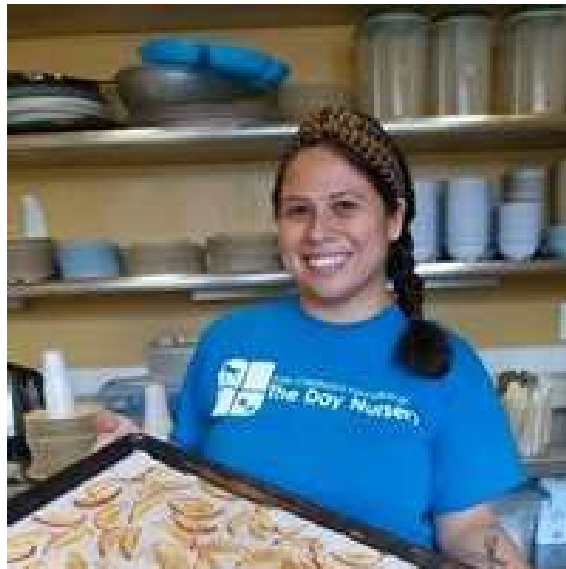
Local apples as a snack or in a meal! The Day Nursery - Oak Park, IL